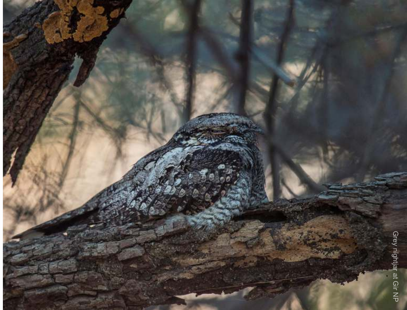
Grey nighthawk at Gir NP