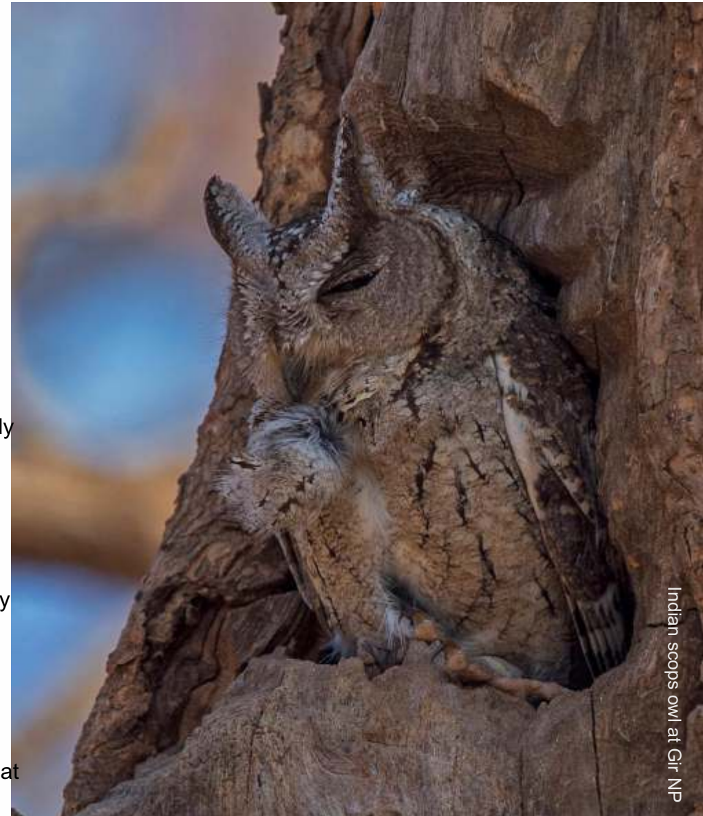
Indian scops owl at Gir NP

To conclude, this enclosed area will offer you a good opportunity to photograph the rarities amidst a dry and rugged yet dramatic landscape and feel the nature at her best.